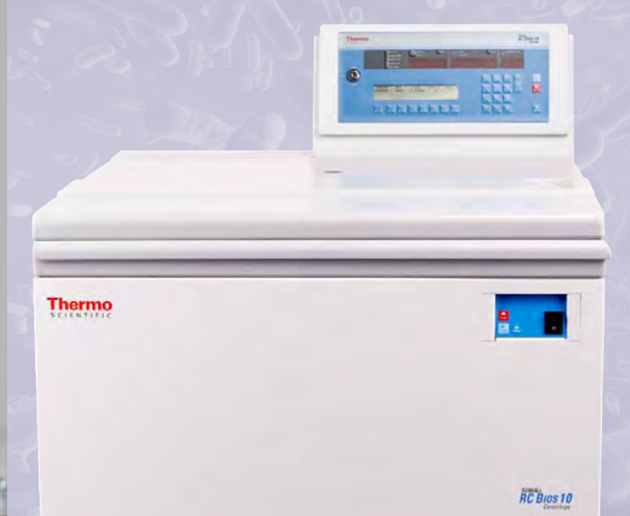
Thermo Scientific Sorvall RC BIOS Centrifuge Systems